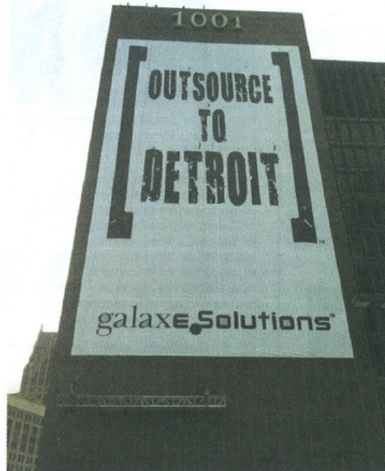
GalaxE.Solutions unveiled its "Outsource to Detroit" banner last month at its Woodward Avenue location.

The tower at the RenCen vacated by Deloitte won't be sitting empty. In May, Blue Cross Blue Shield of Michigan began moving the first group of 3,000 employees from Southfield to its new offices in the RenCen. BCB-SM will have approximately 6,000 employees working downtown by 2012, when the entire move is complete. □